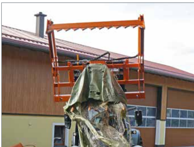
SBS with film catcher in use

© Hauer 2025/09. The illustrated products may differ from standard specification products. Subject to errors and changes.