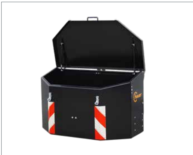
Tool box standard equipment