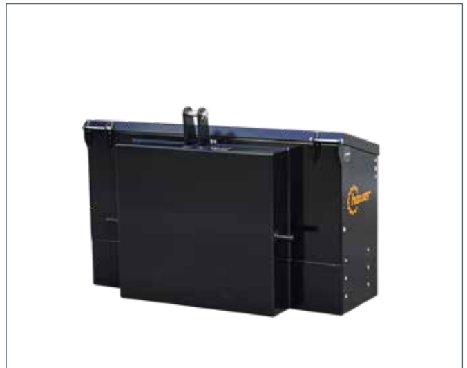
Tool box standard equipment