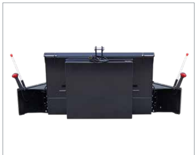
Tool box fully equipped