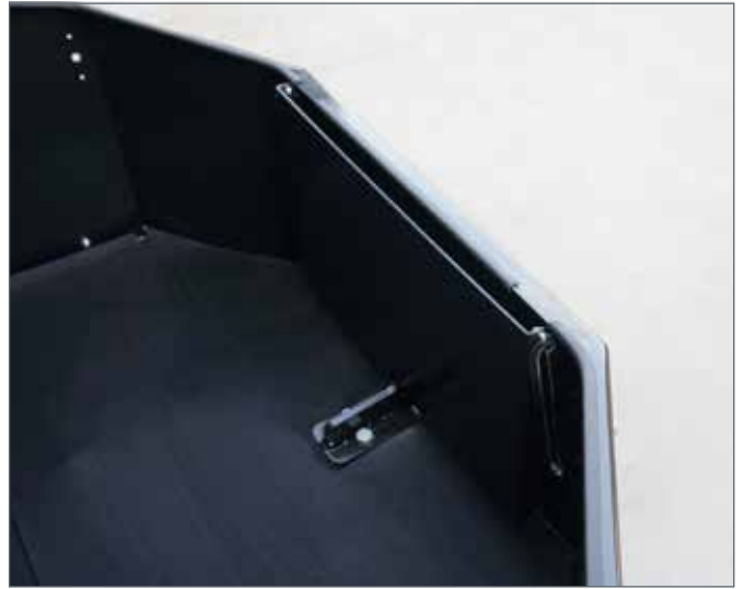
Work bench folded in