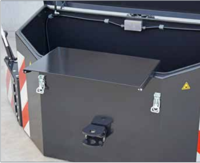
Work bench folded out