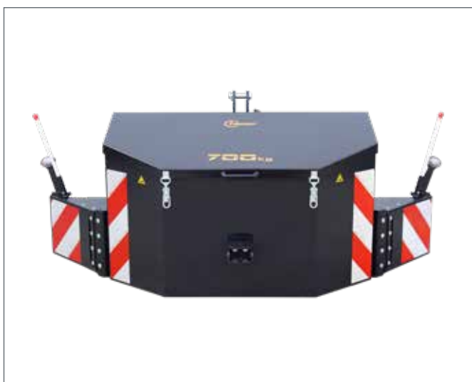
Tool box fully equipped