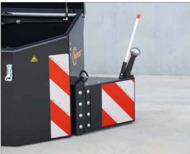
Underride protection, incl. side marker lamps