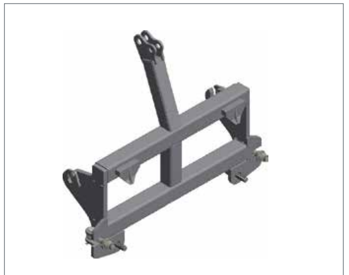
Attachment frame front weight for coupling plate DIN 76060-B Euro size 3