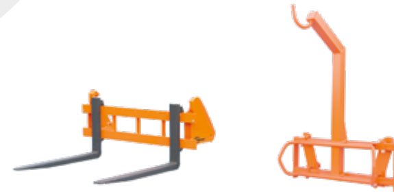
Lifting devices Various pallet forks with different equipment, big-bag-lifter, load hooks, extension arm for load hook, fork lift, ...