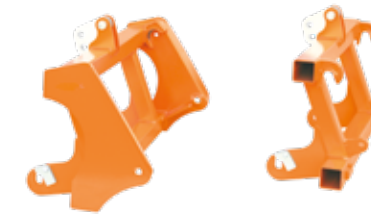
Adapters 3-point quick attach carriage, carriage adapter, 3-point adapter, ...