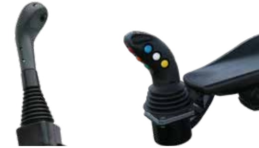
Control valves Joystick cable remote control valve, electro proportional control unit ELC ergo 2