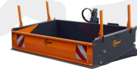
Special implements Tipping box, cage, hydraulic attachment locking system, hydraulic slewing mechanism, ...