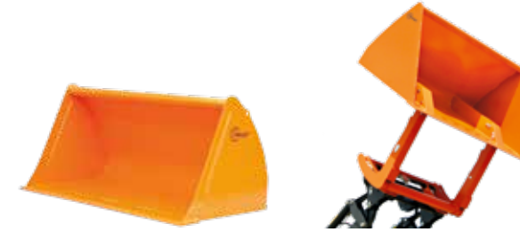
Buckets Earth bucket, light material bucket, high-volume bucket, high-tip bucket, silage grab, multi grab bucket, 5 in 1 multifunction bucket, ...