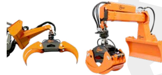
Forestry Log grapple, brushwood grab, forestry grab bucket, logging blade, timber grabs ...