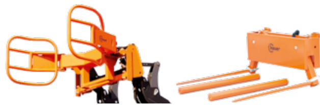
Agriculture Multi grab fork, silage grab fork, bale fork, silage bale grab, round bale grab, silage grab, high-tip silage grab, ...