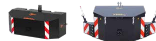
Ballast weights and tool boxes Front and rear ballast weights from 450 up to 2.500 kg, tool boxes with and without ballast